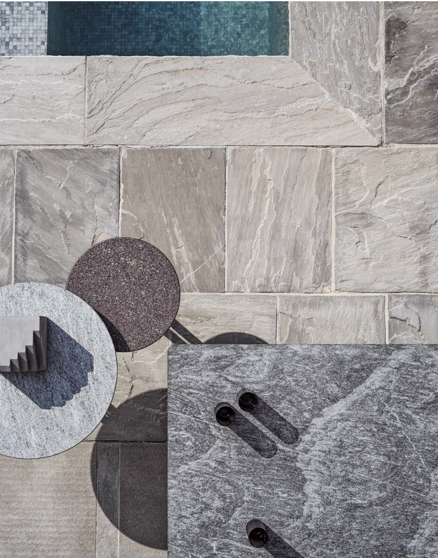
Detail of the different table tops, in Pietra del Cardoso, Beola argentata and porphyry (above). Poised for poolside cocktails, the Peter Outdoor lounge chairs with matching footstools and Phuket woven ottoman are comfortable and inviting (opposite page)