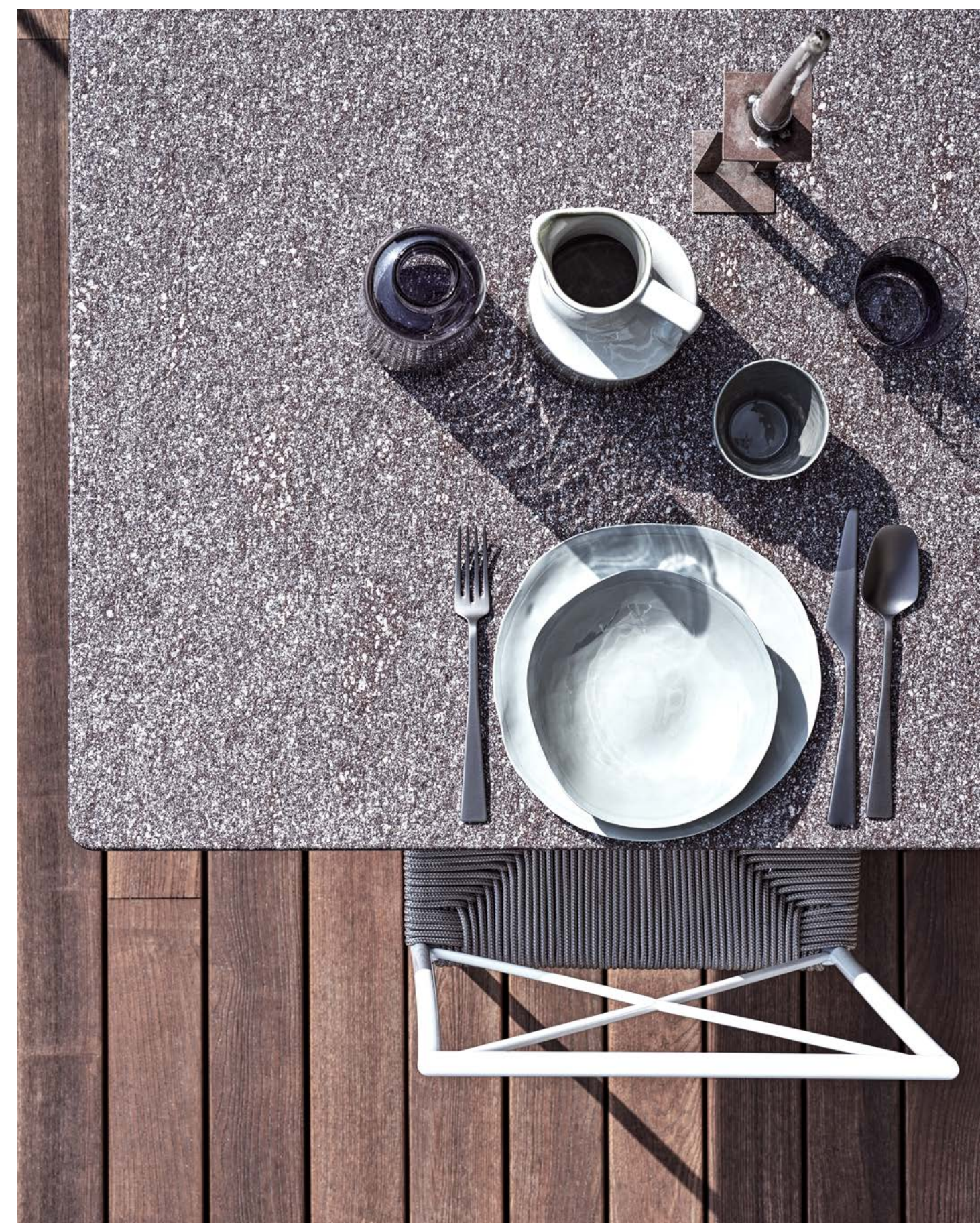
Set for an outdoor lunch on the wood deck, the long Fly Outdoor table with porphyry top and Moka Outdoor chairs in powder-coated white metal with seat in sand-color woven polypropylene cord [opposite page and above]